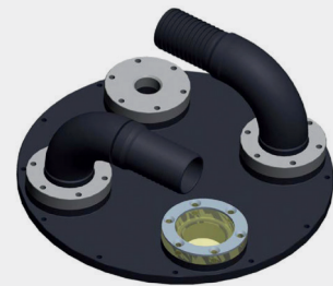
Customised Manifold Plate with a wide range of connection ports on stock