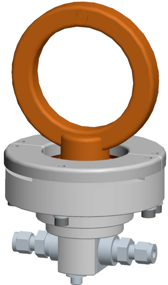
Accumulator package with panel mounted valves